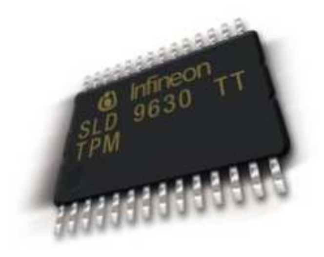
Figure 1.1: A Trusted Computing Platform Module hardware chip

tures mechanisms that allow the TPM to be turned on or off, enabling the user to choose whether or not the TPM is to be used within their computing environment. The task of setting the status of the TPM must be authorised by the owner of the computer. (See above for how the term "owner" is ambiguous.) This can be done remotely with authorisation from the owner, but it is recommended that the owner be required to attend the machine in person (be physically present), and provide some sort of physical verification of authorisation.